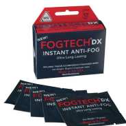
Fog Tech FOGBX12