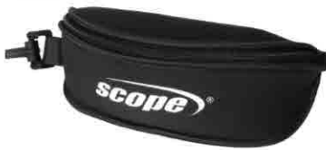
Spec Jacket O103