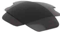
Smoke Spare Lens 180S-SP