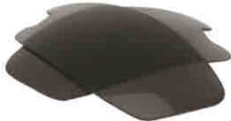
Polarised Spare Lens 180P-SP